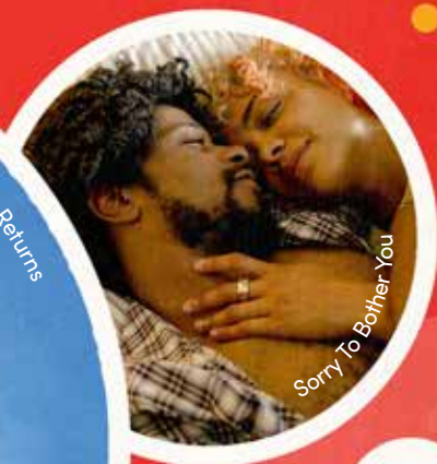
Sorry To Bother You