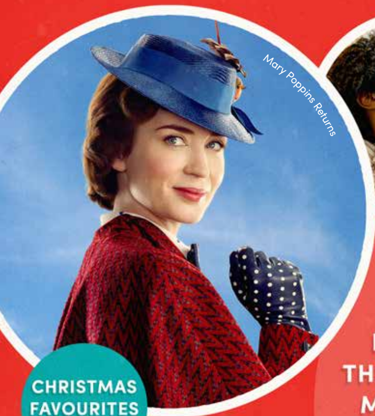
Mary Poppins Returns